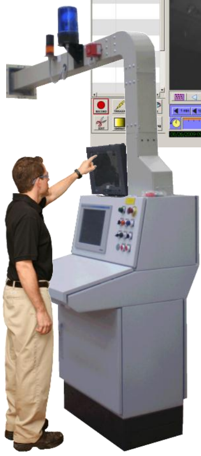
Converting HMI with touch screen interface